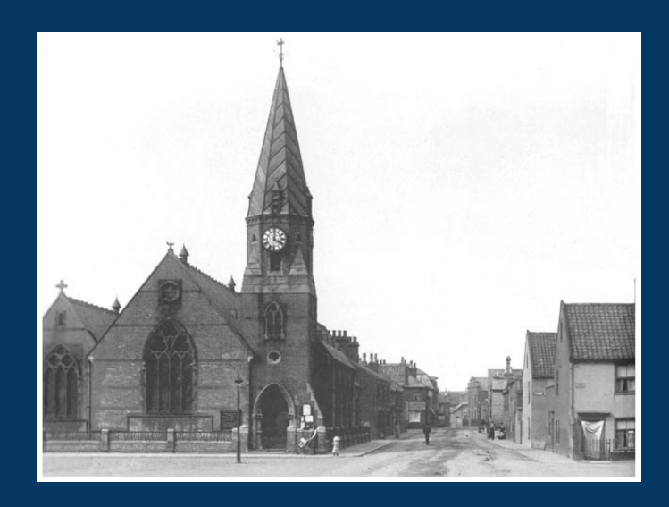
As it used to be in 1920s, serving the immediate community of the Beach Village